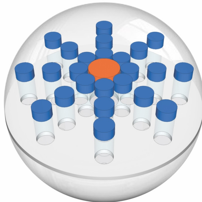
Figure 2. Conceptual design of the multi-compartment ADC phantom. Cells containing different concentrations of PVP near magnet isocenter allow for a range of ADC values to be measured. Strategically placed cells allow for determination of measurement bias off of isocenter. The phantom can be filled with ice water to control temperature, or can accommodate MR-compatible temperature sensors.